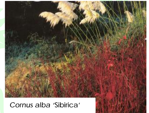
Cornus alba 'Sibirica'

A good winter feature is the bark of the slow growing Acer griseum (paper bark maple). It will be a focal and talking point in any planting scheme.