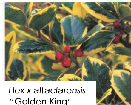
Ilex x altaclarensis 'Golden King'

The amount of evergreen plants is vast and can range from large conifers to small low growing heathers with plenty to choose between.