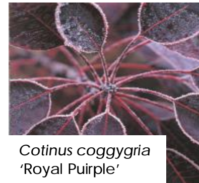
Cotinus coggygria 'Royal Purple'

The structural quality of the evergreen Cotinus coggygria 'Royal Purple' is even more enhanced when outlined with frost.