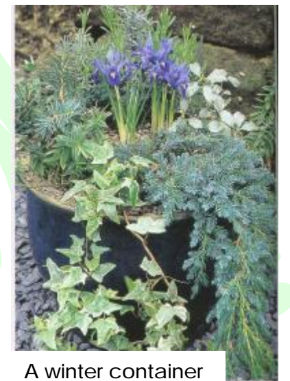
A winter container

This blue and silver themed container contains Juniperus squamata 'Blue Carpet', Abies concolor 'Compacta', Lavandula angustifolia 'Munstead', Pittosporum tenuifolium 'Silver Queen', Hebe albicans 'Snow Cover', Hebe recurva and Iris 'Harmony'